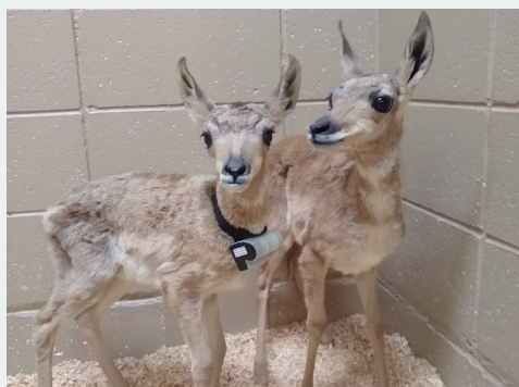
Captive and free ranging wildlife research