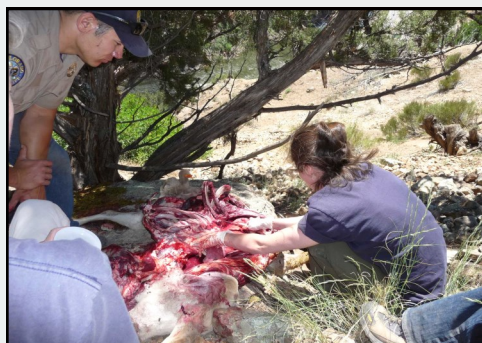
Wildlife necropsy and pathology