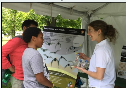
Policy, education, and outreach

Who: Eligible students will be in their 4 th year of veterinary training during the time of the externship. Six to eight students will be accepted each year.