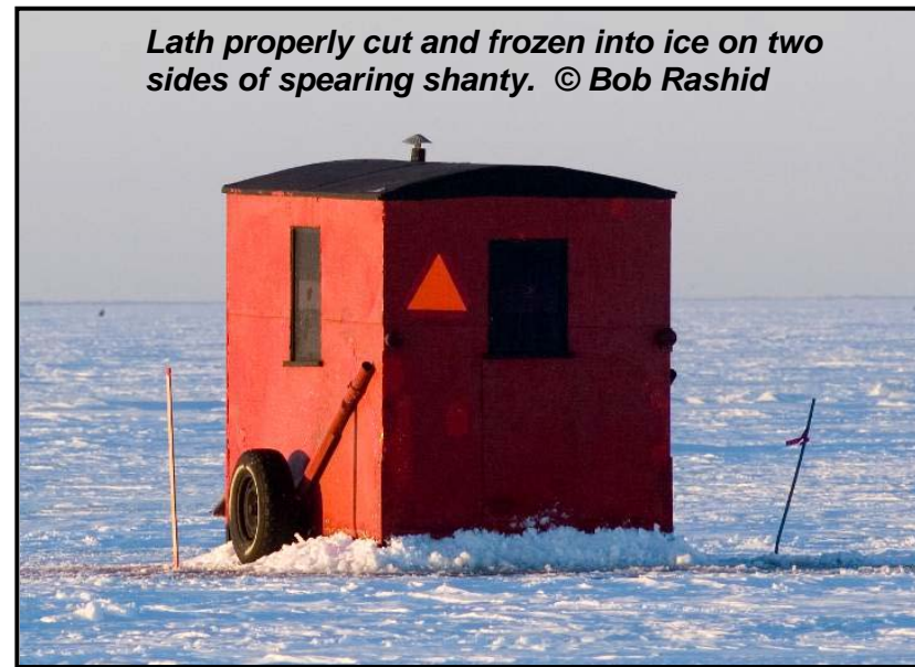
Lath properly cut and frozen into ice on two sides of spearing shanty.

It is unlawful to possess a fishing pole, hook and line angling equipment, or other similar devices that could be used to catch fish in an ice fishing tent, shanty, or ice fishing enclosure with ice holes larger than 12 inches in diameter or square.