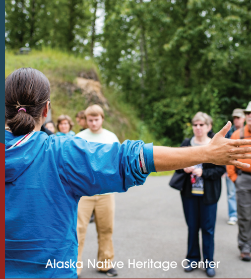
Alaska Native Heritage Center