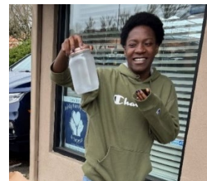
Photo of a client in Clark County learning about savings plans pictured to the right.