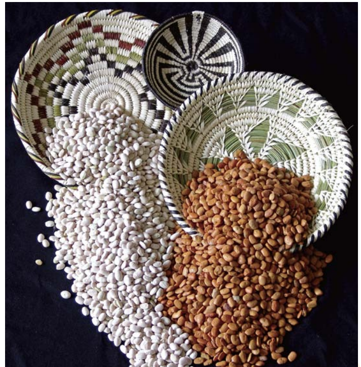
White and brown tepary beans with traditional Tohono O'odham baskets.

Even so, Native American contributions continued to be essential to the survival of Europeans. If not for the generosity and knowledge of the Native peoples who met the explorers Lewis and Clark during their travels in the Northwest from 1804 to 1806, their expedition probably would have ended in disaster. Ultimately, Native encounters with Europeans resulted in the loss of entire Native communities, traditional ways of life, indigenous knowledge, and access to foods that had sustained Native people for thousands of years. War, genocide, disease, dispossession of lands, and ill-conceived federal policies profoundly affected American Indian communities and their environments. The consequences are still felt today. Overharvesting, pollution, and reduction of wilderness habitats have also had an effect on the ability of Native people to grow, gather, or hunt their traditional foods. As they look for ways to keep their cultures alive and to address modern economic and health issues, many Native communities are taking steps to revive their traditional food practices.