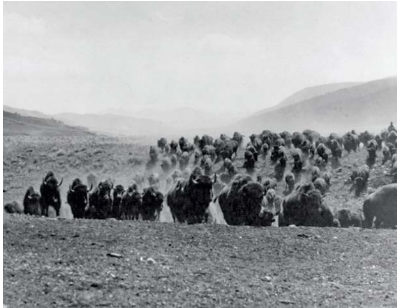
Pte-O-ya-te, the Buffalo People, or Buffalo Nation, 1917. The Lakota considered bison to be relatives, who provided humans with food, clothing, shelter, tools, medicine, and many other necessities.

Native communities have been able to survive and even thrive despite outside influences through traditional ceremonies and gatherings such as the Green Corn Ceremony. Communal