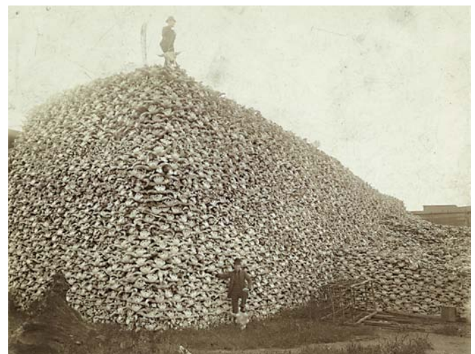
A mountain of bison skulls, ca. 1870. By 1893 only a few hundred bison remained in North America. Today there are hundreds of thousands.