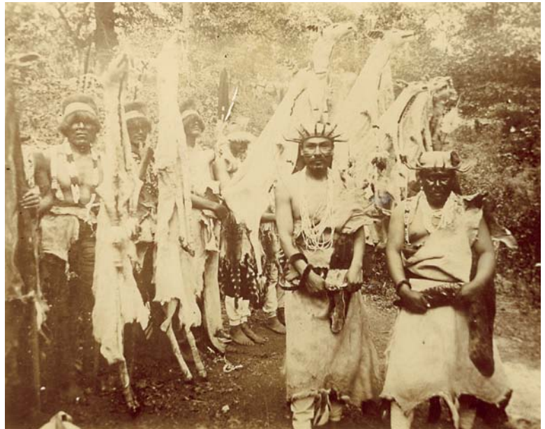
Hupa White Deer Dancers, ca. 1895.

Ultimately, American Indian peoples' connection to place is about more than simply caring for the environment. That connection has been maintained through generations of observation, in which people developed environmental knowledge and philosophies. People took actions to ensure the long-term sustainability