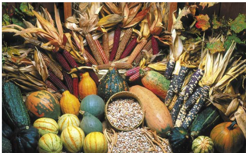
Some of the food plants that the Haudenosaunee give thanks for are corn, beans, and squash.