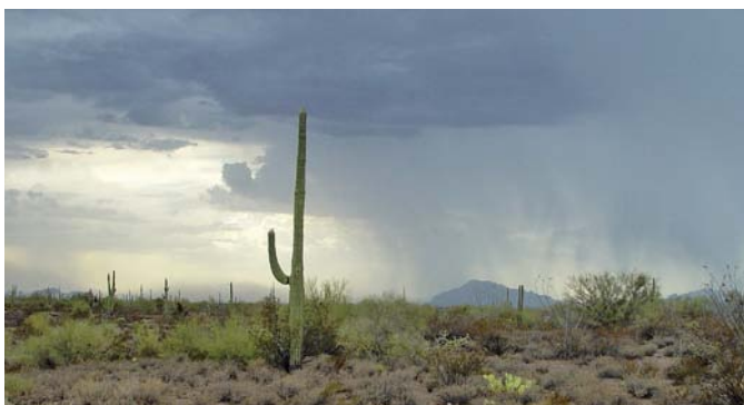
Summer in southern Arizona and northern Mexico brings extreme heat and life-sustaining rains.

As in many Native communities during the past sixty years, processed foods high in sugars began to replace locally grown foods, and a more sedentary lifestyle developed when traditional forms of exercise and work became unnecessary. This change in diet and lifestyle has led to a high incidence of diabetes and other health problems. In response to the health crisis, the O'odham are working to grow and market their traditional foods through an organization called Tohono O'odham Community Action (TOCA). TOCA is dedicated to