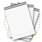
Plastic shipping envelopes