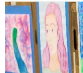
Family Life Education (FLE)

Click on Family Life Education (FLE) icon