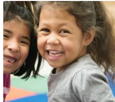
Elementary School Academics (K-6)

Scroll down and click on Elementary School Academics (K-6) icon