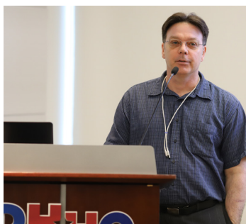
Far left: An event highlight was the submission of the “Give Us Your App Idea” promotion