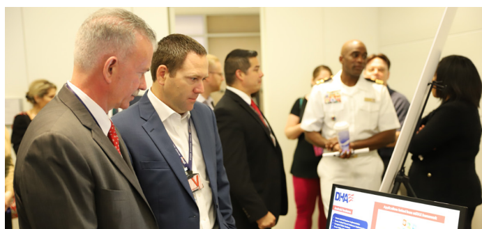
WMT Open House attendees read about mSTAX, the DHA mobile applications software platform