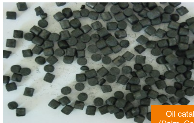
Oil catalysts (Palm, Cooking)