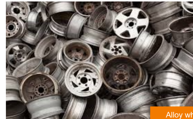
Alloy wheel (1000, 6000)