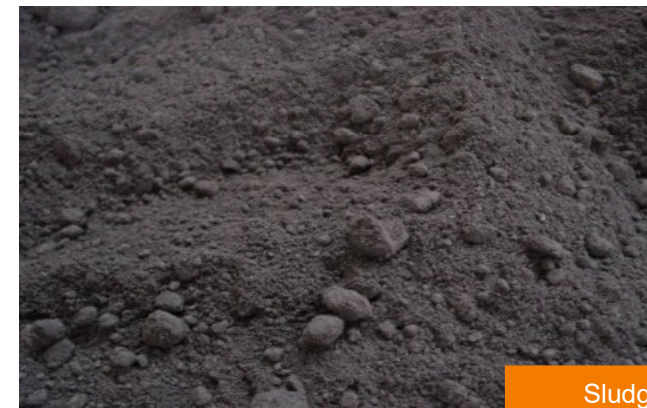
Sludge (Metal Containing)