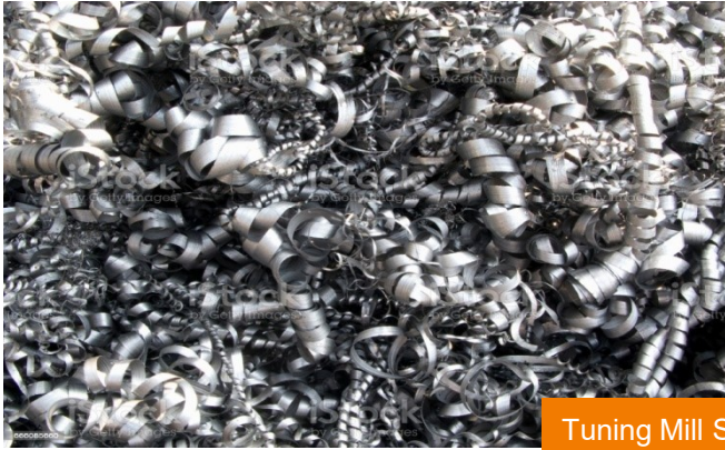
Tuning Mill Scrap (Ferro Non Ferro)