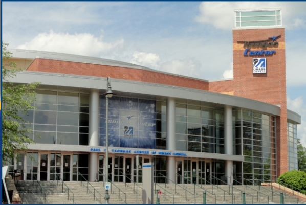
Tsongas Center at UMASS Lowell

The Navy and its STP Team are pleased to announce that starting in 2019, we are taking our annual Forum for SBIR/STTR Transition on the road to some of the nation's most exciting technology centers – starting with New England's Boston area, and the University of Massachusetts. Senior Naval leadership has challenged us to deliver innovation to warfighters, faster, by exploring new collaborations with emerging American tech hubs. And the STP program is meeting this challenge through a New England partnership designed to mobilize a new generation of government, industry and academic innovators.