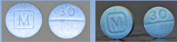
Oxycodone: Authentic (left) and counterfeit (right)

Counterfeit pills are fake medications. They may contain fentanyl or methamphetamine and are extremely dangerous because they often appear identical to legitimate prescription pills.