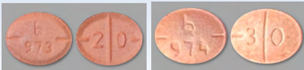
Adderall: Authentic (left) and counterfeit (right)

Counterfeit pills are nearly identical to prescription medications. They may resemble oxycodone, alprazolam (Xanax), Adderall, and other medications. Students may purchase Xanax for anxiety, and Adderall in the belief that it will aid their academics, with many of these purchases made on the internet or social media sites. Many of these sites sell counterfeit versions of these drugs tainted with fentanyl and/or meth, which can lead to death.