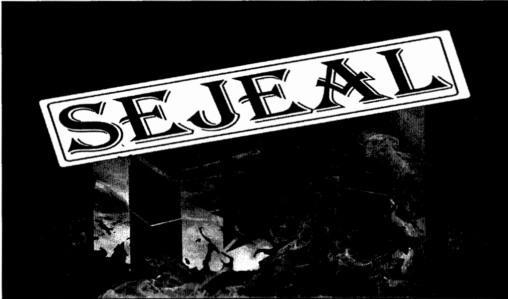
Victim-2: Israeli Telecommunications Provider

b. Defendant modified the contents of the website to display the text “Sejeal,” and to display imagery of a burning Israeli flag. The following is a screenshot of the defacement of the Victim-1 website: