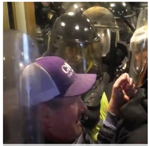
WILSON in the tunnel

The following screenshots were obtained from the recordings and depict some of the aforementioned activity: