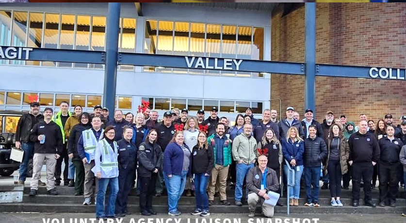
VOLUNTARY AGENCY LIAISON SNAPSHOT

This collaboration shows how private-public partnerships work together to accelerate recovery and strengthen local response capacity.