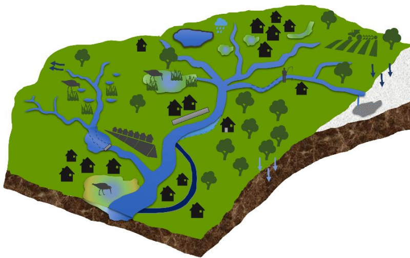
A diagram representing the River Thames catchment and the approaches being considered by the Thames Valley Flood Scheme

This newsletter will keep you updated on the Thames Valley Flood Scheme as the project progresses. To find out more, please visit our Citizen Space webpage or email: TVFS@environment-agency.gov.uk .