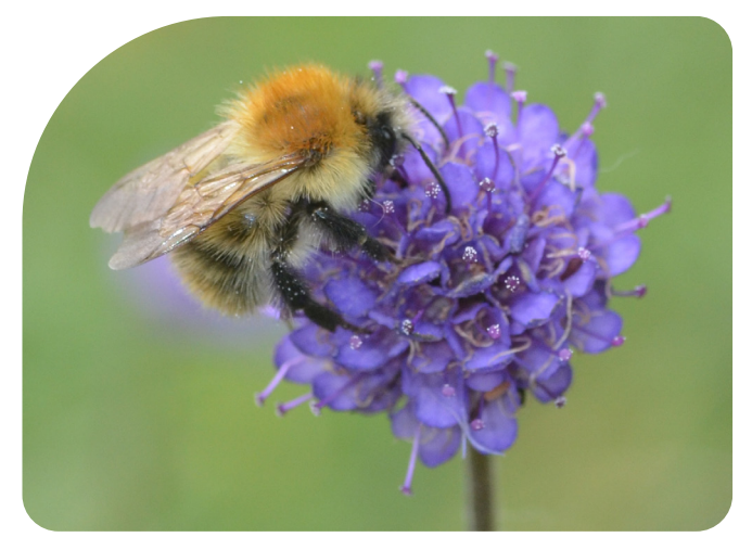
Common carder bumblebee