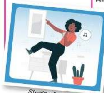
Singing for Fun