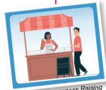
Dementia Awareness Raising at Tamworth Market

Please come and join us for a dementia friendly service. All welcome.