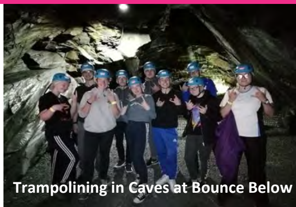
Trampolining in Caves at Bounce Below

Welcome to our new look newsletter! Giving you up to date information on services, events and activities available to you. For Information on all our services see page 2 - 3 or access our Information Pack from 9th Sep 2019 at https://www.solihullcarers.org/carers-5-to-25/support-for-me-from-solihull-carers-centre/