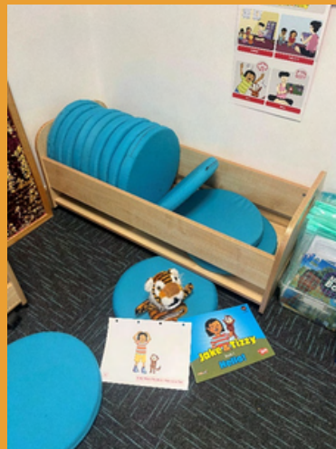
Redhill Primary School