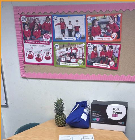
St Patrick's Catholic Primary School