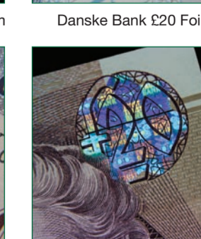
Bank of Ireland £20 Hologram