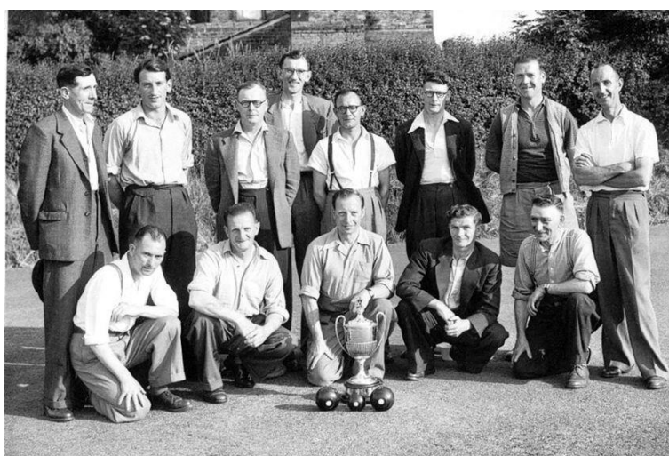
1955 Dinnington Miners Welfare Bowling Team with Telegraph Cup Moving on to more recent times