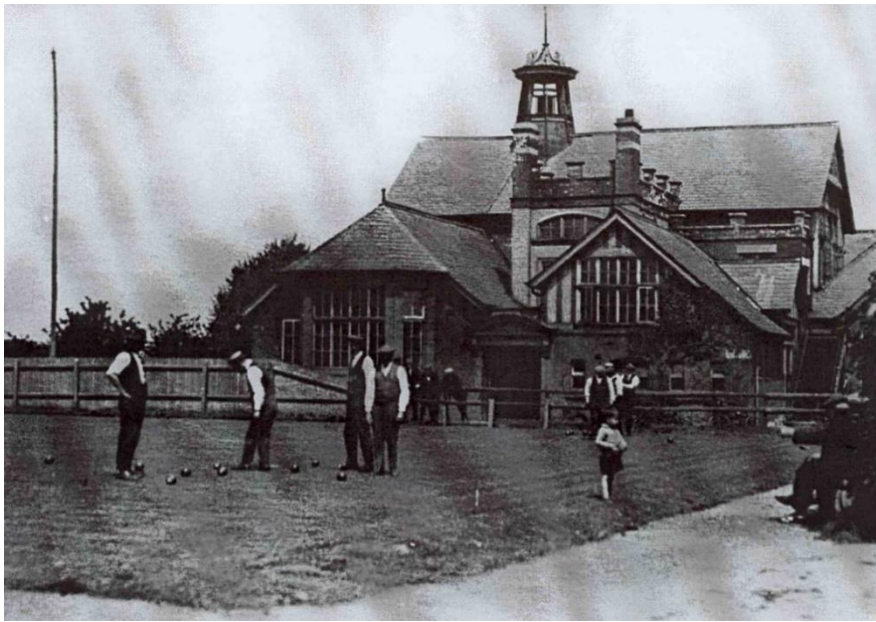
Dinnington Colliery Institute 1935

The Club was established in 1923. It was originally sited next door to the Dinnington Colliery Institute building on Laughton Road, Dinnington as depicted below.