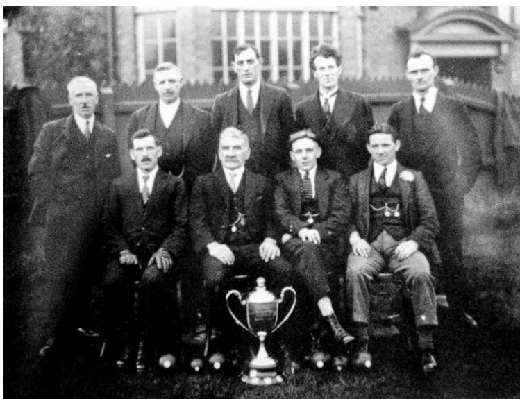
1923 Dinnington Bowling Club with Mason Cup

The Bowling club has a long and proud history as can be seen from the following photographs: