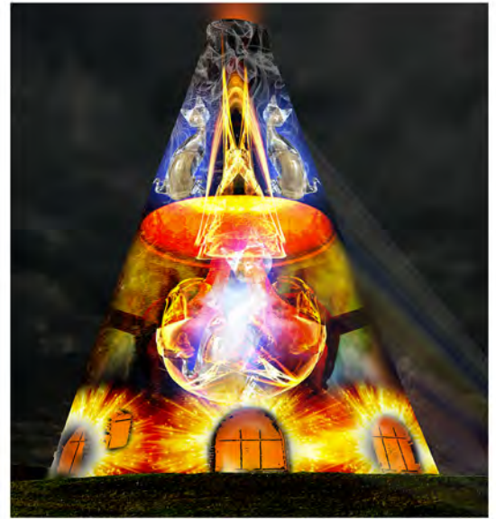
An idea of what our projection might look like

We are creating a video projection on Catcliffe Cone, looking at the processes of glass making, and the idea of change and transformation. As part of this we need your help. We want you to think of a person, place, object or gift that reminds you of when something changed in your life. It might be about getting a year older, moving house, a new friend, a place or feeling. Then draw this object on the cone below, or if you prefer write about it on the cone instead. We will collect these drawings and descriptions and use them in the projection.