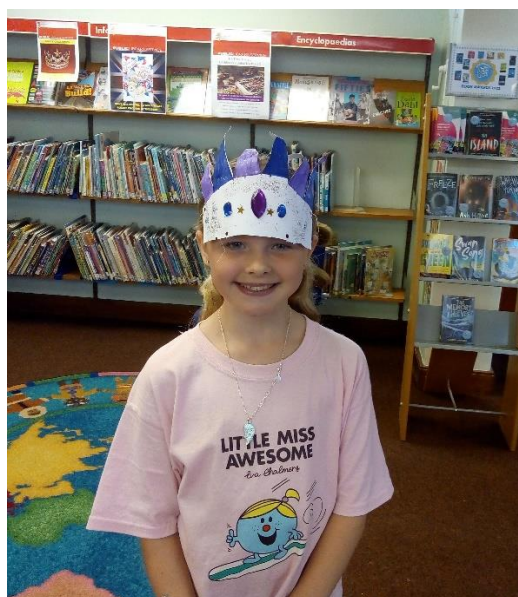
Jubilee crown making activity at Alderman Lacey Library in June