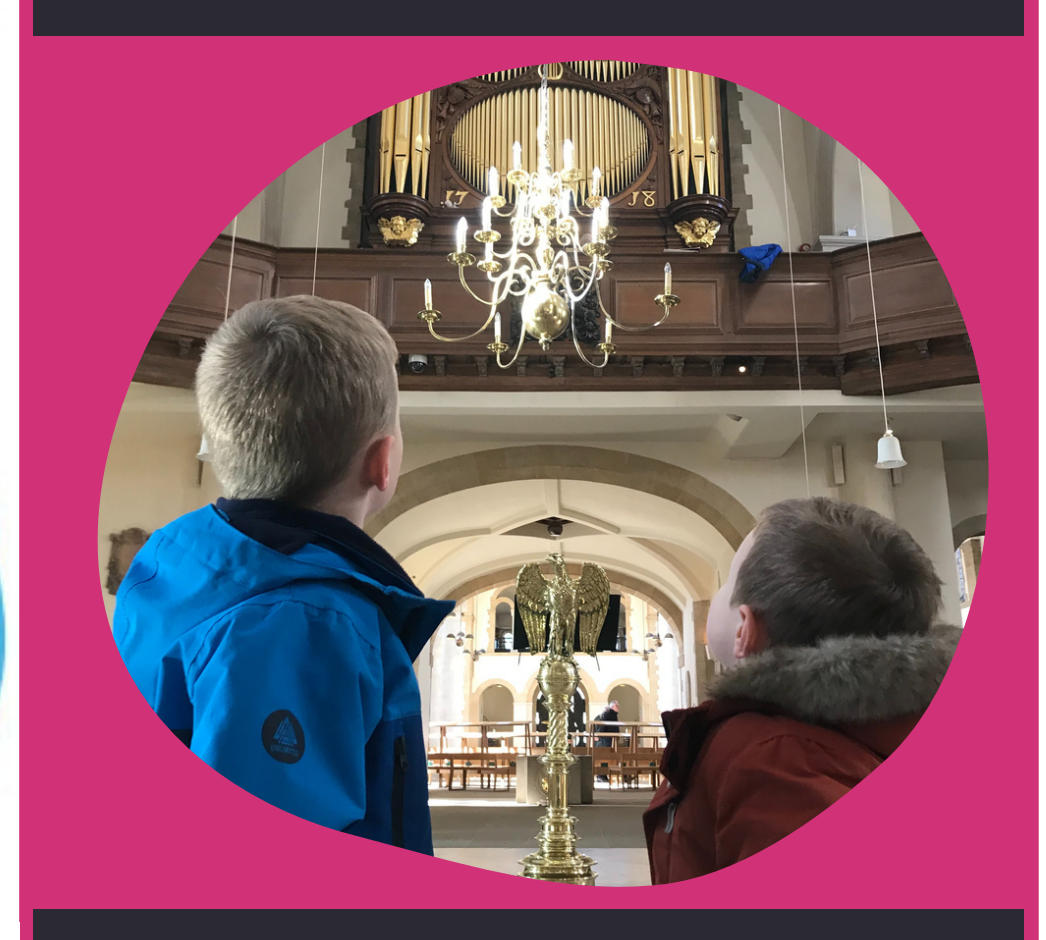
#34 Woodland Wandering