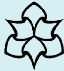
Manchester Metropolitan University