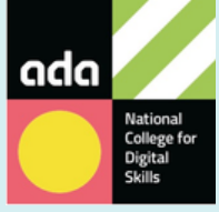
Ada, The National College for Digital Skills