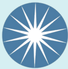
Open Data Manchester