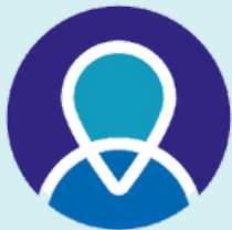
Manchester Local Care Organisation