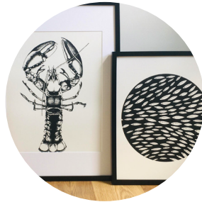
Anoushka Cole @studioanoushkaCole