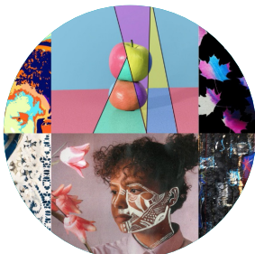
The Norwood School Visual Art Department @thenorwoodschoollondon