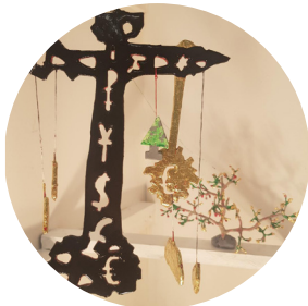
Yair Meshoulam @yairmeshoulam