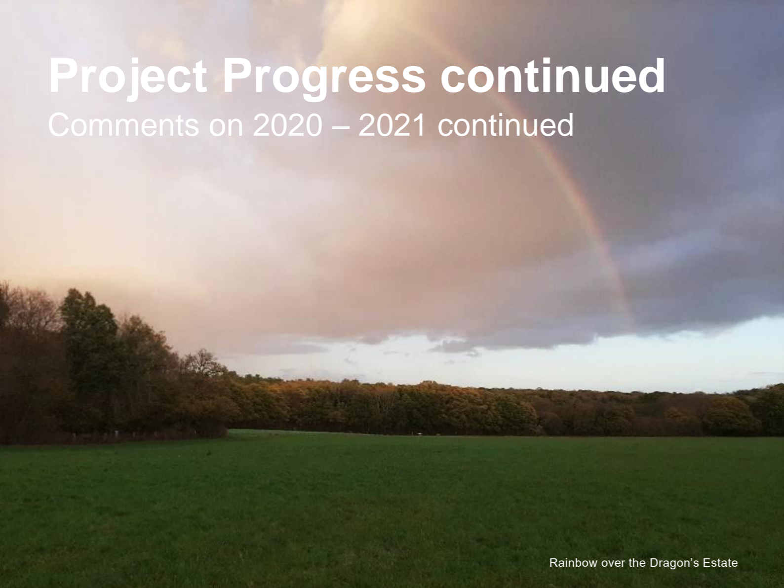
Rainbow over the Dragon's Estate