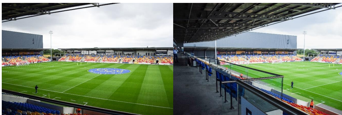
Left: View of the West Stand from East Stand Block A, Row T Right: East Stand wheelchair and mobility scooter spaces

Tickets for these spaces are not available to book online and can only be obtained via phone or in person with the Ticket Office.