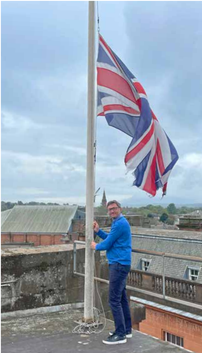
Raising the Union Flag at Council Headquarters

We hope that you find this special edition interesting and uplifting.