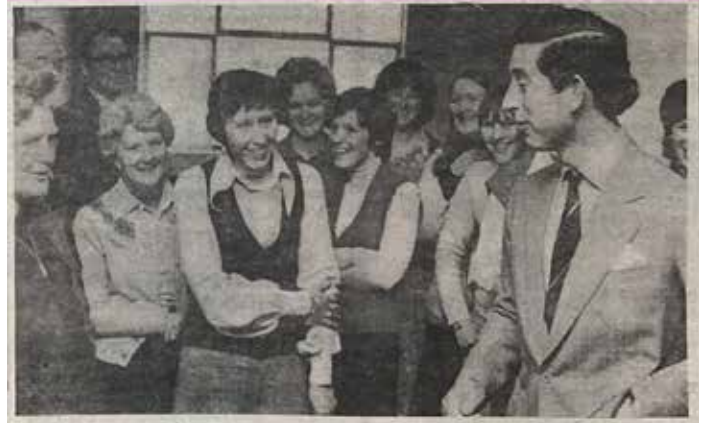
Time for a chat with some of the workers at Century Aluminium, Sanquhar, after the royal visitor had made a tour of the factory. "There's not much work being done here, today," joked the Prince