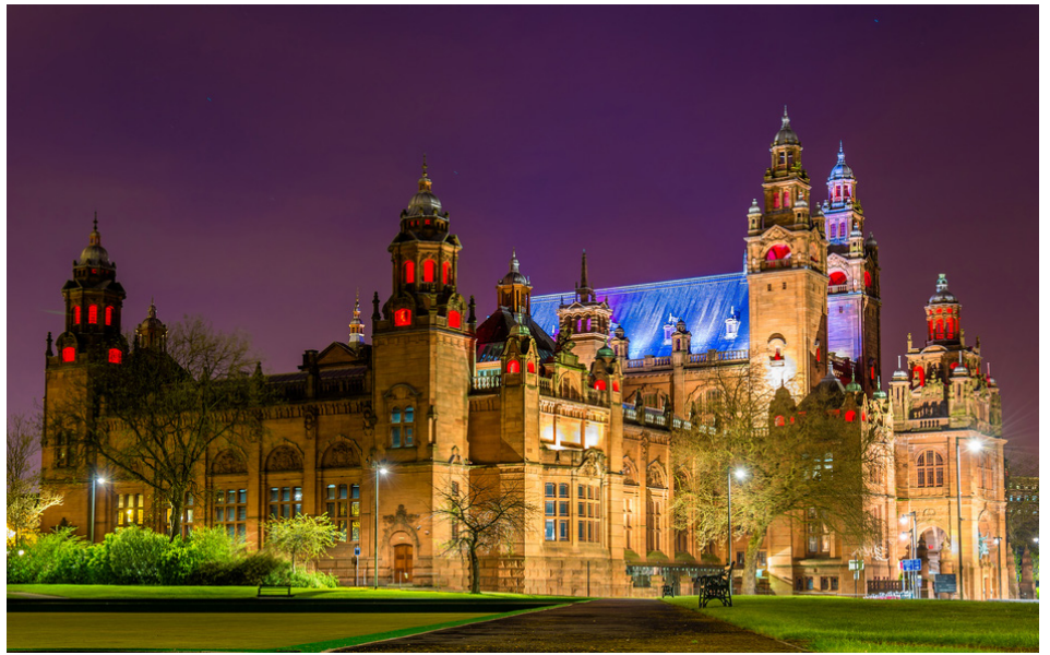
Kelvingrove Art Gallery and Museum