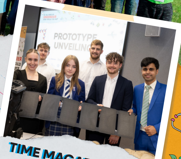
TIME MAGAZINE'S GIRL OF THE YEAR