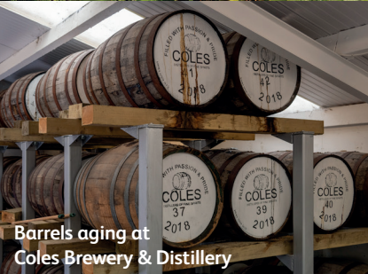
Barrels aging at Coles Brewery & Distillery

did attract Italian historians. They came and conducted research but their findings proved inconclusive leaving open the possibility that this family legend may have some truth in it!