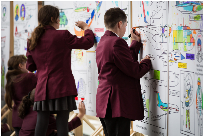
Students writing on the wall Contains public sector information licensed under the Open Government Licence v3.0.

More details on this can be found on; https://www.gov.uk/government/publications/the-service-pupil-premium/service-pupil-premium-what-you-need-to-know .