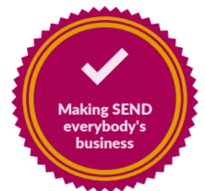
Making SEND everybody's Business logo

For EHC plans that are already in place, finding a new school that can accommodate this can be harder, and although most children's needs can be met in their local mainstream school some children will require a special school. SEN teams can help support with this and more information can be found here .