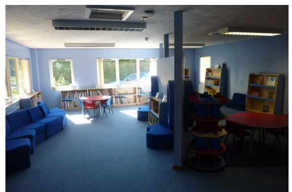
Wittering Primary Library

We use our Service Premium money in a variety of ways. We provide access to a family support worker who can help at times of emotional stress such as deployment or if the children are struggling to settle.