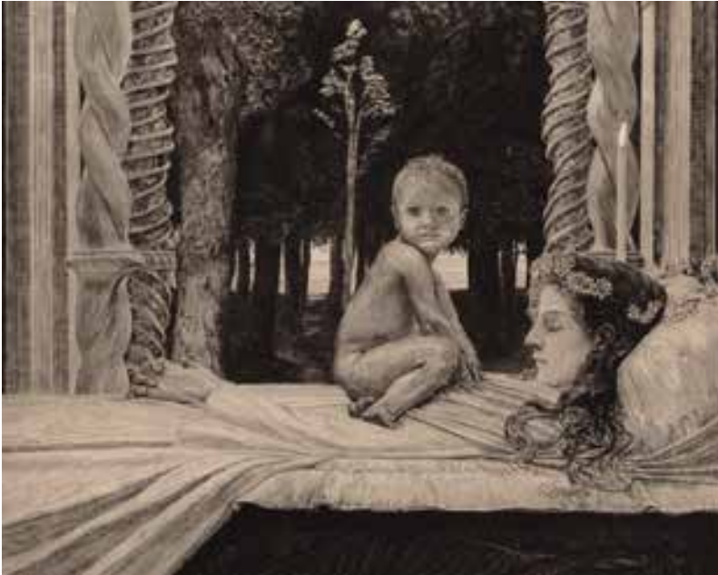
Max Klinger (1857–1920) – On Death Part Two, Dead Mother , 1898