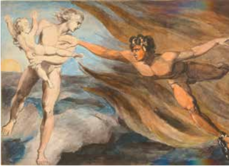
William Blake (1757–1827) – The Good and Evil Angels Struggling for Possession of a Child c.1793