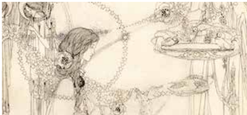
Jessie Marion King (1875–1949) The White Lady , 1903