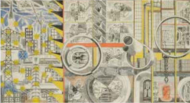
Mural for the Entrance Hall to the Morgan Crucible Company Battersea Works' 1957-1958