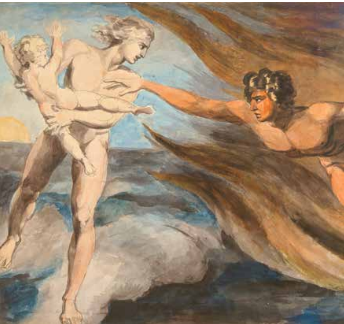
William Blake (1757–1827) – The Good and Evil Angels Struggling for Possession of a Child c.1793