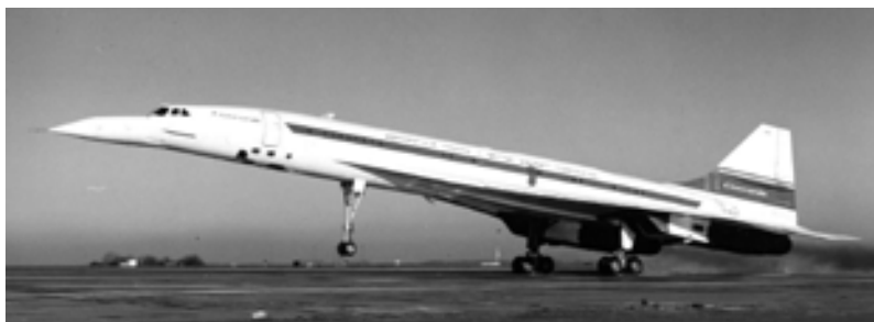
Concorde at Thurleigh in 1972