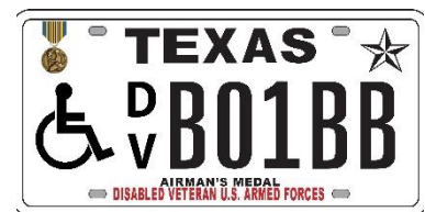
Plate with Stacked DV Alpha Characters

To assist in the manufacturing process for the newly designed Disabled Veteran (DV) ISA plates, an exclamation point ("!") is used in the manufactured plate number as a placeholder for the Stacked DV text characters. As a result, you will see ! in the Mfg Plate No field and DV in the Plate No field on the Special Plate Information SPL002 screen.