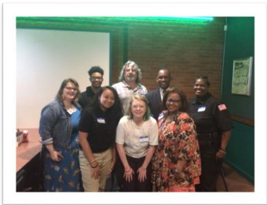
Councilwoman attended the Juvenile Justice Meeting at Leonard's Barbeque