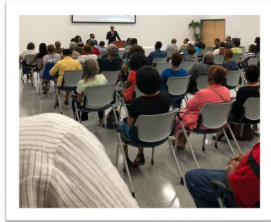
Community meeting concerning Elvis Presley Enterprises’ development plans for Whitehaven