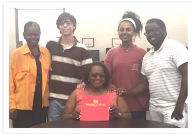
Councilwoman Robinson and Rhodes College students discuss intentional afterschool care for middle schoolers