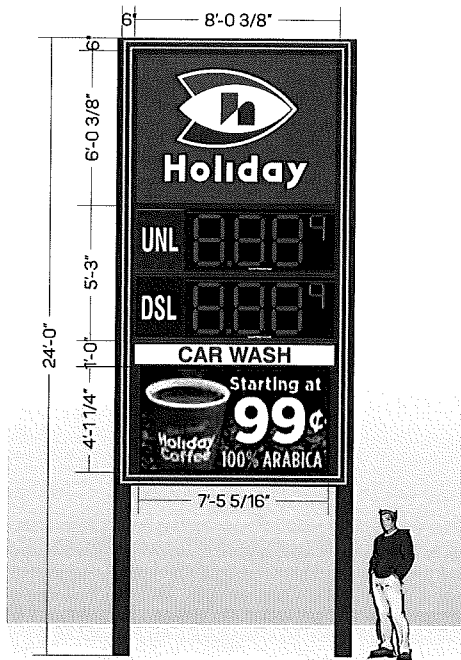
The proposed dynamic display sign on the renovated present sign directed to White Bear Avenue