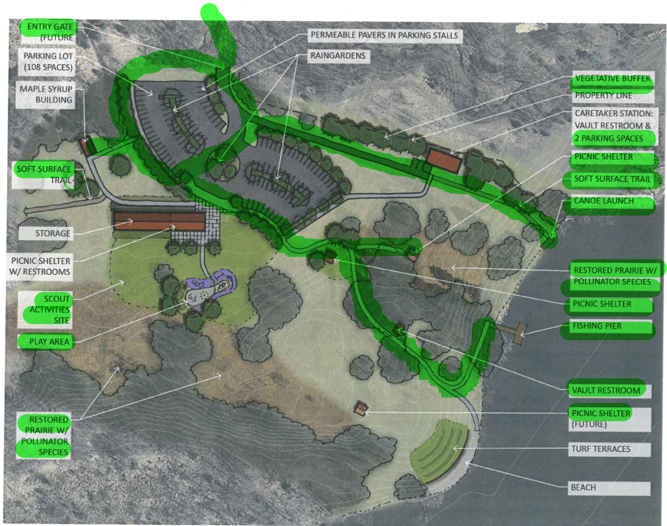
Program Area Concept Plan

The amenities highlighted below are the selected items from the Kraemer Lake – Wildwood Master Plan (Phase I, II, and III) that are proposed to be included in this grant request.