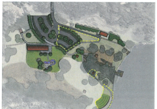
Figure 16: Phase 3 Development