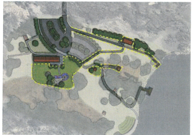
Figure 15: Phase 2 Development