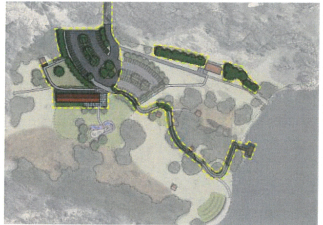
Figure 14: Phase 1 Development