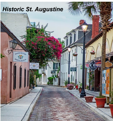
Historic St. Augustine