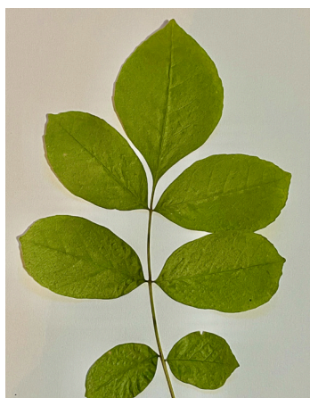
Oregon Ash leaf