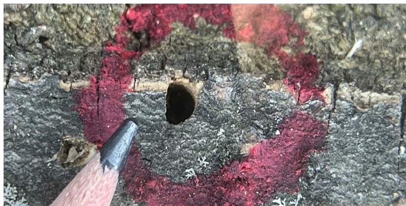
D-shaped emergence hole