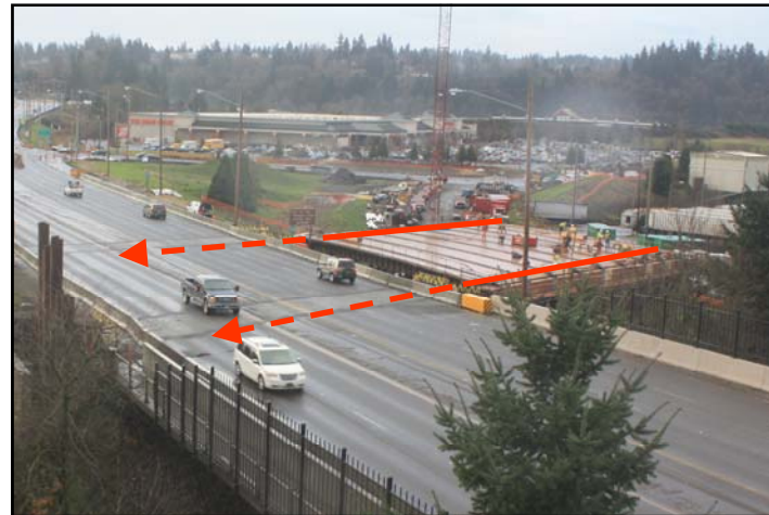
The new bridge, currently under construction on the west side of the highway, will slide into its permanent position.

Once the bridge is in place and the highway is reopened, the contractor will work on completing the realignment of Washington Street under the new bridge.