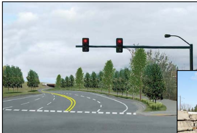
A realigned Washington Street, shown at right and in the artist rendition above, will pass under the bridge.