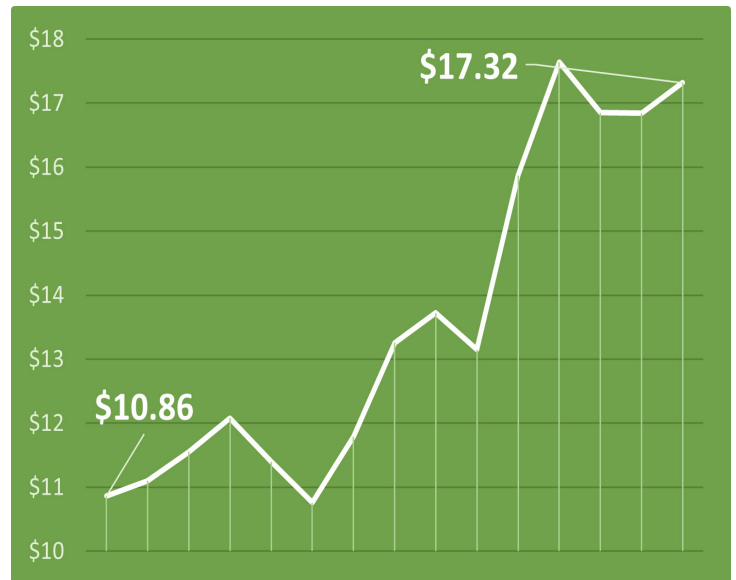
12-MONTH END 2012 - 2025 (in billions)