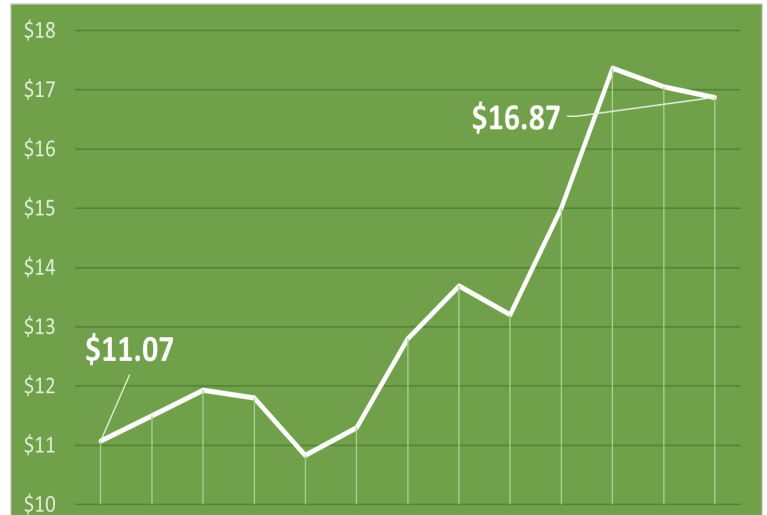
12-MONTH END 2012 - 2024 (in billions)

Tax sources for the same time period show total income tax increased 3.4% , total sales and use tax decreased 1.0% , motor vehicle tax decreased 4.1% and other sources increased 0.6% .