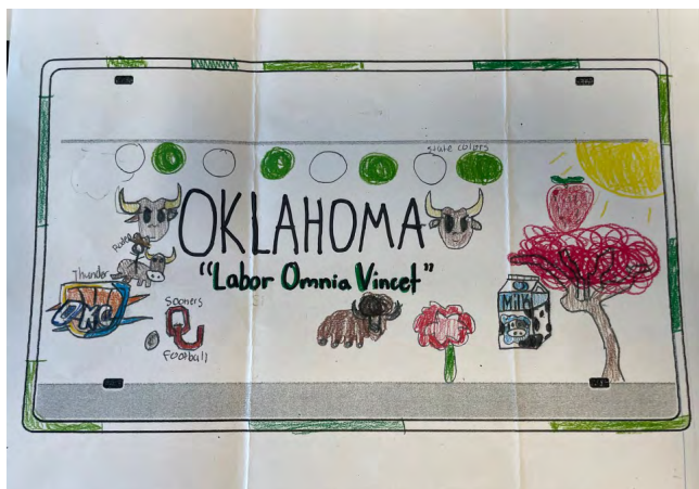
A license plate designed and submitted by a student.