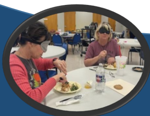
Independent Living Skills