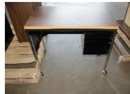
1 table (31" W x 30" D x 31" H)