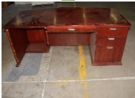
Four-drawer wood desk (72" W x 36" D x 29" H)