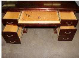
Five-drawer wood desk w/two writing pull-outs (72" W x 36" D x 31" H)

Questions? Contact rebecca.watson@omes.ok.gov .