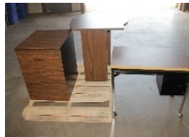
1 two-drawer file cabinet (20" W x 24" D x 28" H)