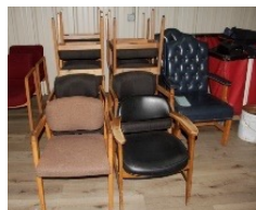
Lot of 12 assorted wood frame stationary office chairs