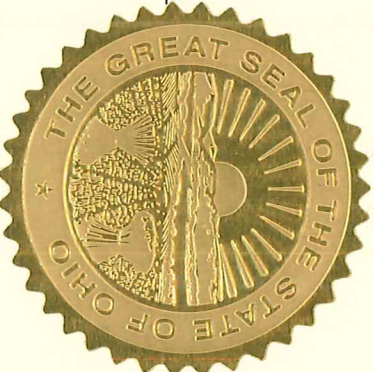
Jon Husted Lieutenant Governor