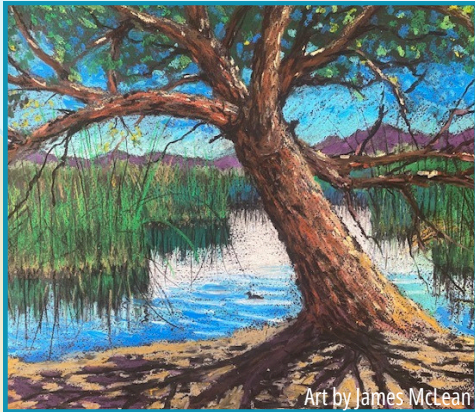
Art by James McLean

Artists who participated in the plein air painting at Wetlands Art Day have been invited to our art show, Unbound! Visit the SONGallery through July 24 to see their work inspired by Wetlands Park scenery.