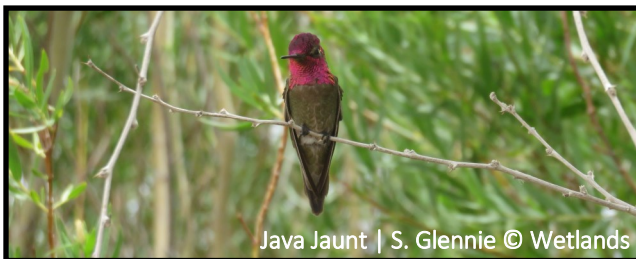
Java Jaunt