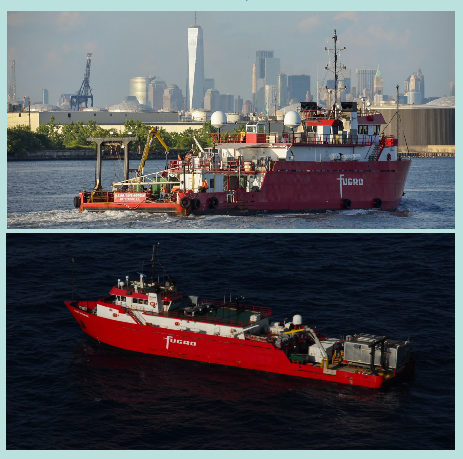
Above: R/V Enterprise is 170ft in length and will operate 24hr a day, weather permitting.

Above: Schematic diagram of proposed geophysical and marine mammal survey equipment towed behind the R/V Enterprise .